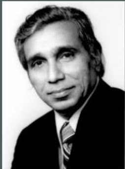
Fazlur Rahman Khan