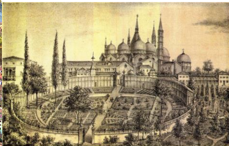
Aerial view of the Pontifical Basilica of Saint Anthony and the Botanical Garden of Padova