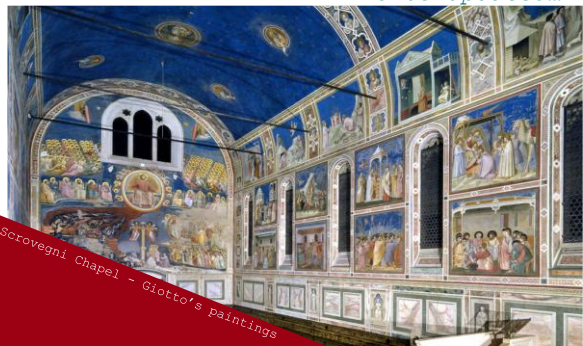
Scrovegni Chapel - Giotto's paintings